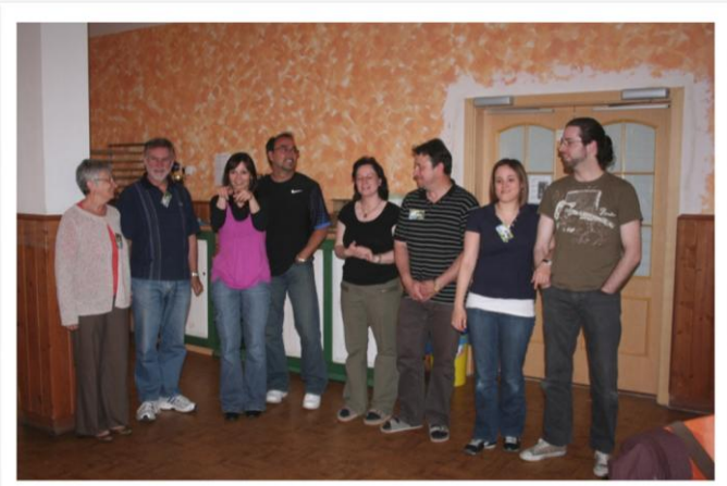
Our fantastic team, which made this event so great.