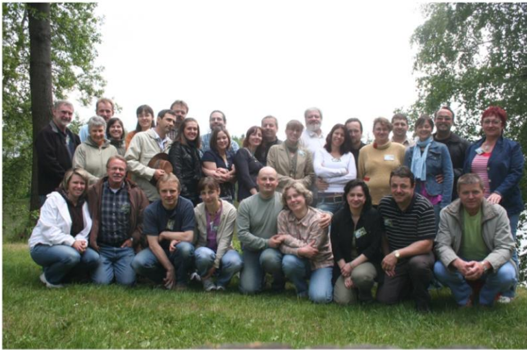
We were there, we were blessed!

During Easter we started putting names of Family members, friends and Colleges on our wooden cross in Church. Well, the numbers have grown and our cross is now totally covered with little papers. Every Wednesday and every Sunday we pray for those people. Last Sunday we baptized one of the coworkers of a church member who came to Christ. A brother that had been gone for 4 years returned home to our church and new sister was also baptized. Some of the moms that come to our Kids clubs started asking questions about God. There have been changes in families that were totally against hearing or talking about Christ. Now there is peace and they are open to talk.